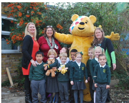
Raising money with Pudsey.